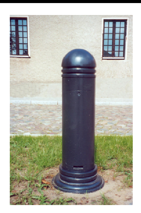
Application example TVP-300