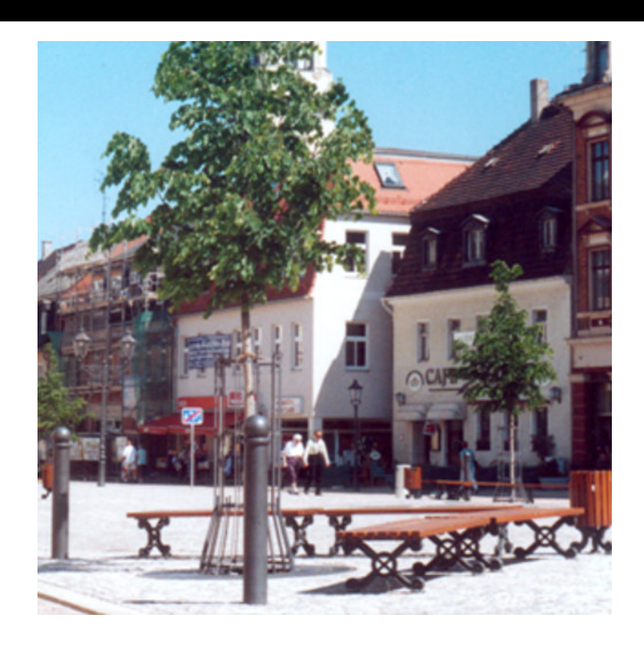
Application example TVP-3500